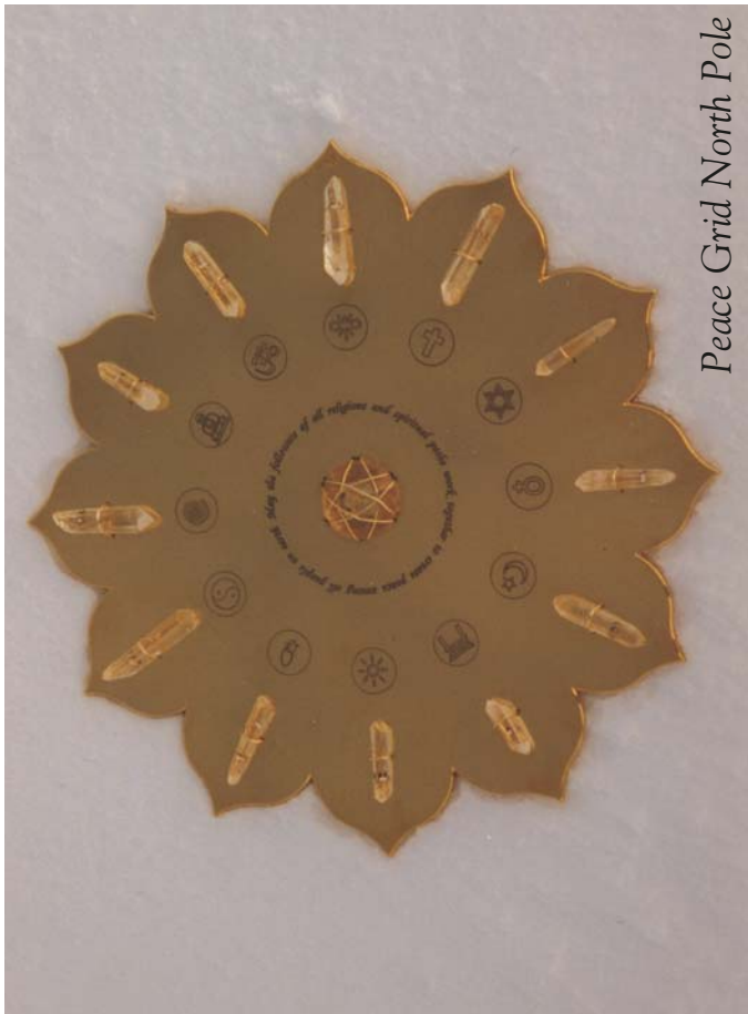
Peace Grid North Pole