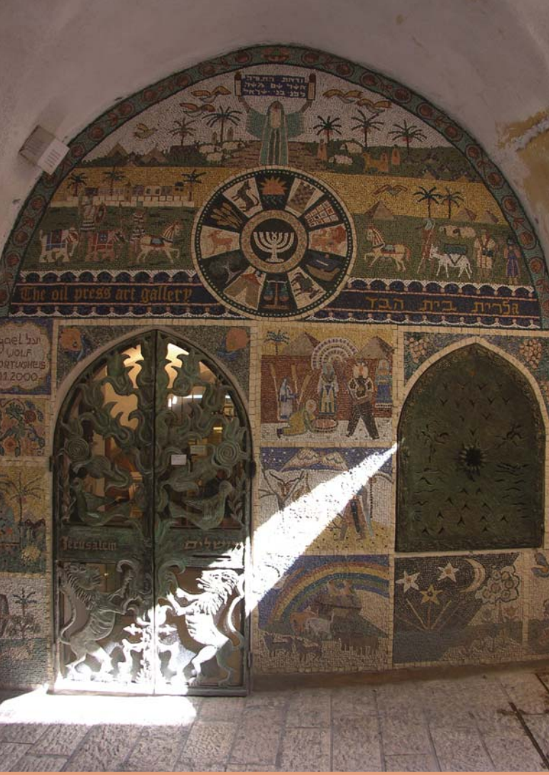
Counterclockwise from above: Entrance to the Oil Press Art Gallery - the light beam just happened to be there when I took the picture. Oil Press stones. Smudging during class inside the gallery. There are miles of streets like this. Another street scene. Doorway to the ancient wall that surrounded Solomon's Temple.