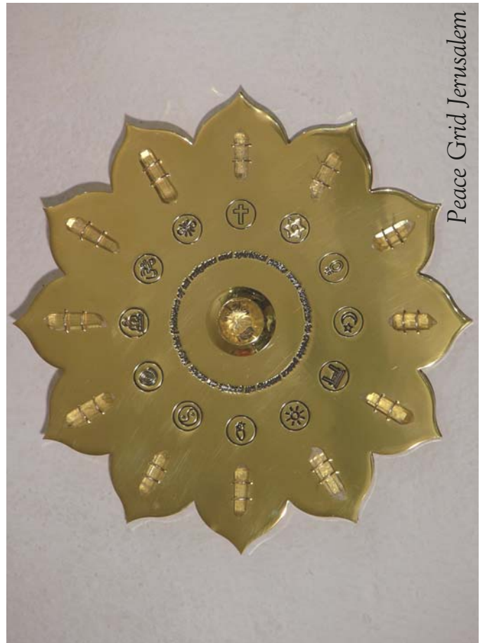
Peace Grid Jerusalem