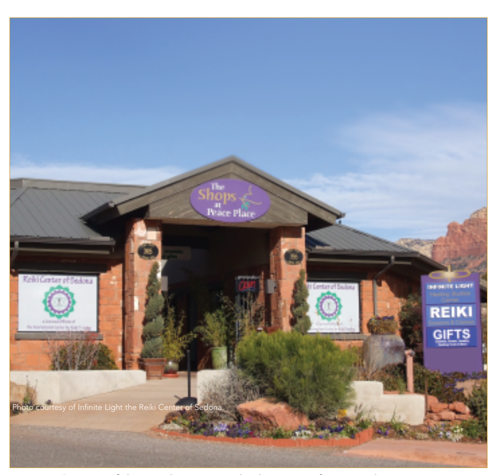
Give careful consideration to the location of your Reiki practice.

Check your state government Web site for a list of databases and other sources to search to make sure the name you wish to use has not already been taken. Give thought to the name you choose, as it will affect all of your branding and marketing efforts.