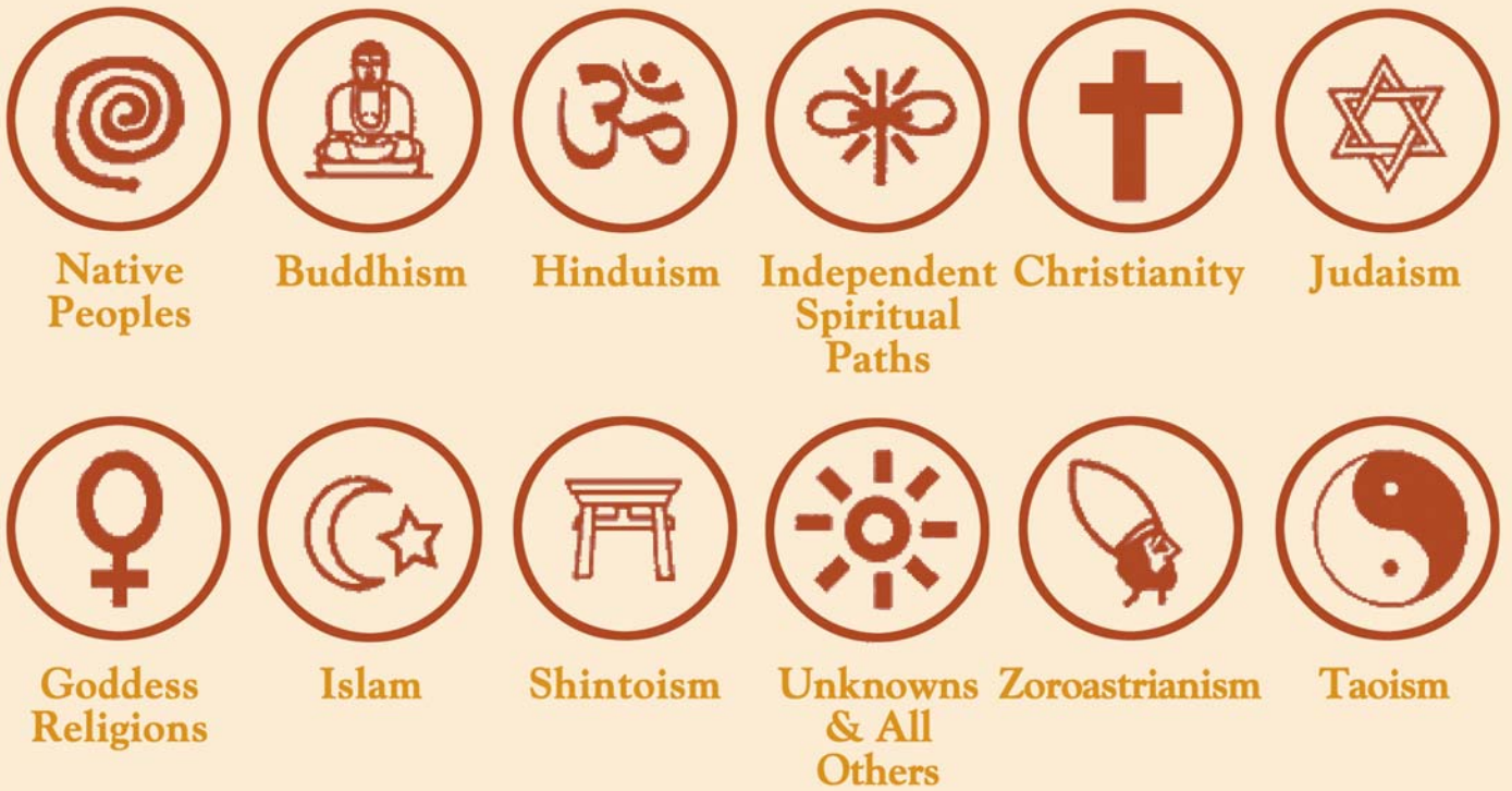
Symbols on the World Peace Crystal Grid

tures have been passed out, and copies of all three are at the end of this article. Copies of all the pictures can also be downloaded from our web site at www.reiki.org .