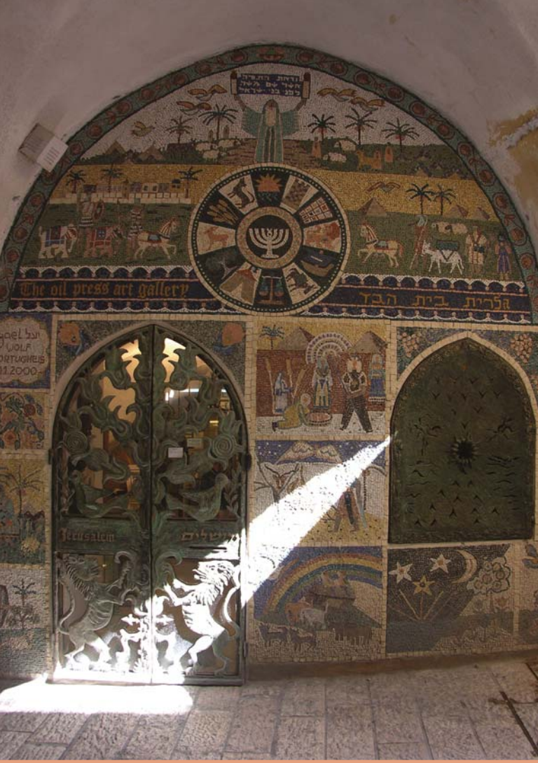
Counterclockwise from above: Entrance to the Oil Press Art Gallery - the light beam just happened to be there when I took the picture. Oil Press stones. Smudging during class inside the gallery. There are miles of streets like this. Another street scene. Doorway to the ancient wall that surrounded Solomon's Temple.